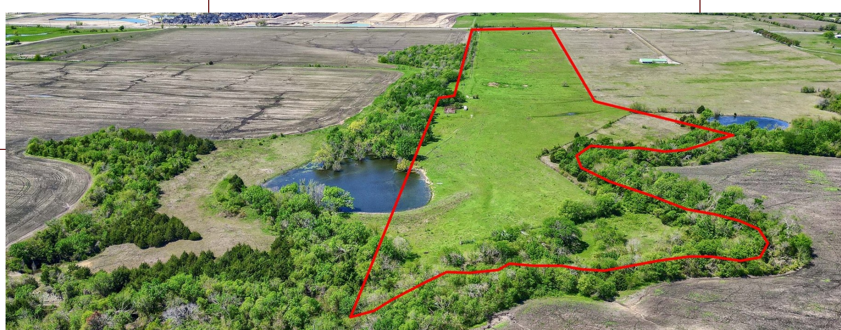
See back for contact information.