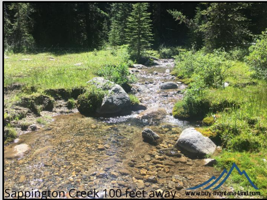
Sappington Creek 100 feet away

Here it is. The Montana mountain property you've been waiting for that's surrounded by the Beaverhead/Deer Lodge National Forest. Let me say that again, it's SURROUNDED BY NATIONAL FOREST . There's no neighbors. This is an extremely rare find. It's right out in the middle of the Beaverhead Deer Lodge National Forest not just along the edge of it. There's an unmaintained county road that comes close to the property and then a short stretch of open National Forest road to drive to the property where the shop sits and where there's plenty of other level building or camping areas that are ready to go with some of the most amazing views of the surrounding mountains. There's Granite Mountain, Lion Mountain, Cleve Mountain, and Sheriff Mountains in the area just to name just a few. The mountains are above tree line and it's got that great alpine look and feel. It's a must see to believe and experience.